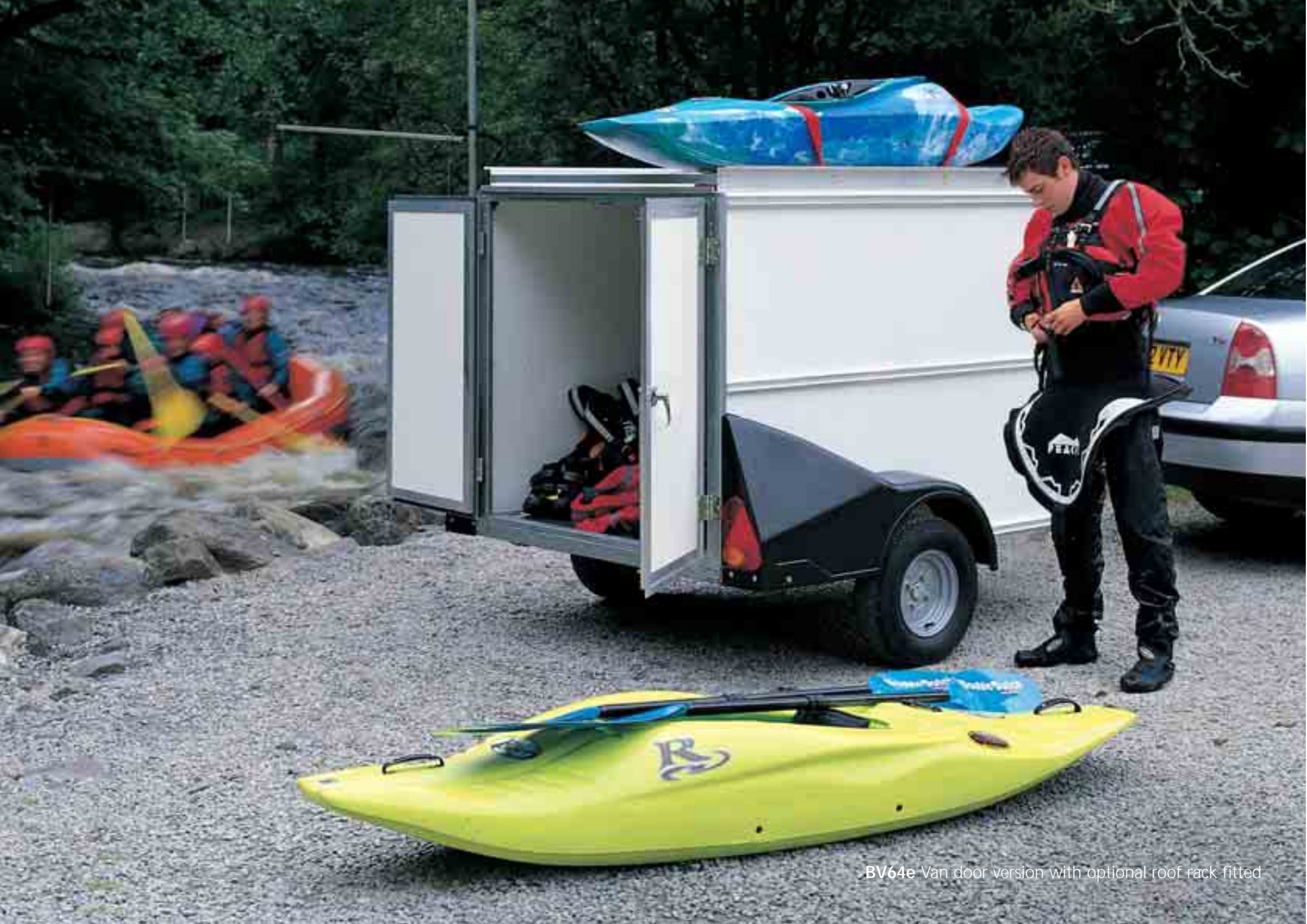
BV64e Van door version with optional roof rack fitted