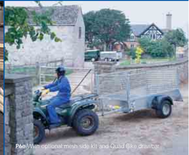
P6e With optional mesh side kit and Quad Bike drawbar