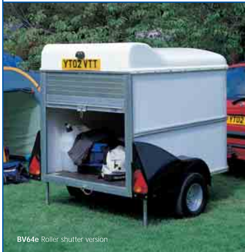
BV64e Roller shutter version