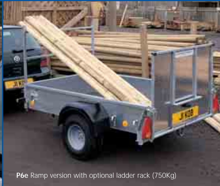
P6e Ramp version with optional ladder rack (750Kg)