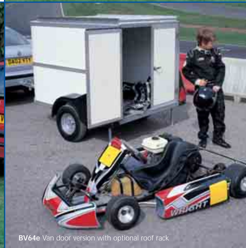
BV64e Van door version with optional roof rack