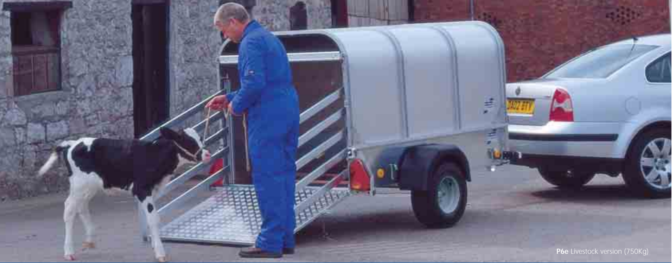
P6e Livestock version (750Kg)