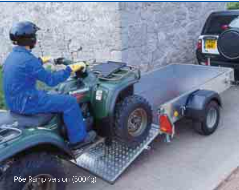
P6e Ramp version (500Kg)