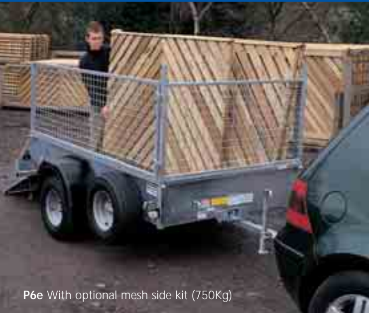
P6e With optional mesh side kit (750Kg)